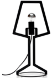
Outline table lamp small 38 cm