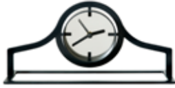
Outline clock low