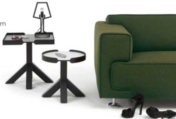
Table lamp small: 1.1 kg Table lamp medium: 2 kg Floor lamp: 8 kg Clock: 1 kg