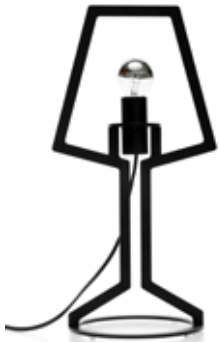
Outline table lamp medium 53 cm